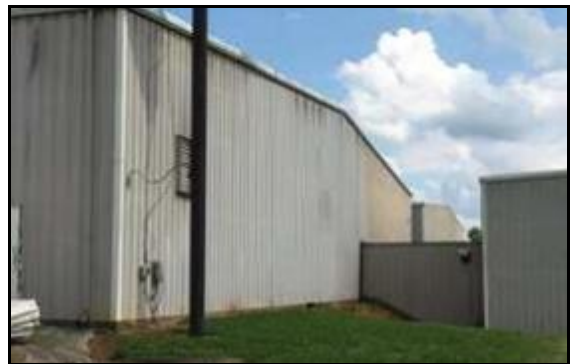
Rear View of Buildings