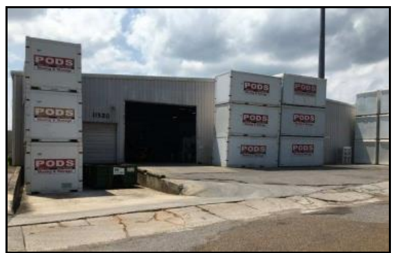
View of Building 2