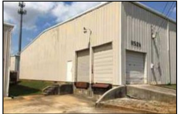
View of Building 1