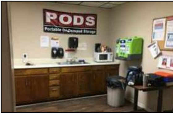
View of Office Area