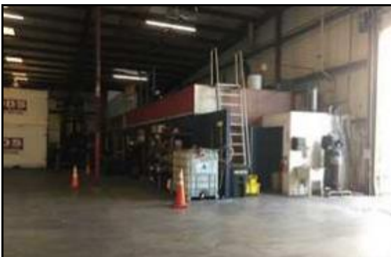
View of Office Area within Building 2